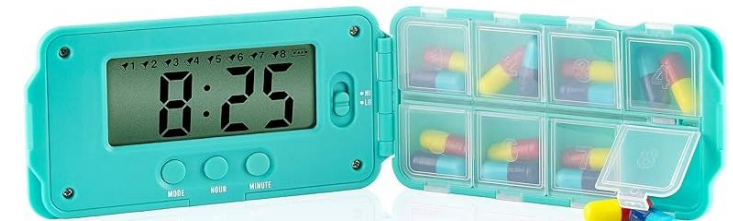
Pill timers and info packs